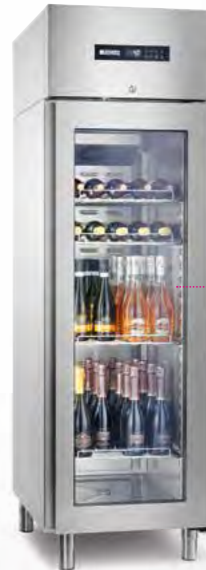
mod. S V

8 coppie guide a "L" 8 s/s pair of "L" runners