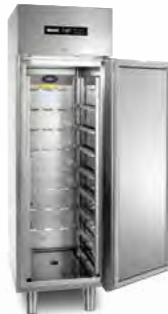
mod. S EN

12 vaschette polietilene 12 polyethylene containers (400 x 600 x h 70)