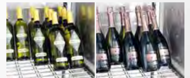
Griglia inox portabottiglie oblique S/S oblique shelf for bottles