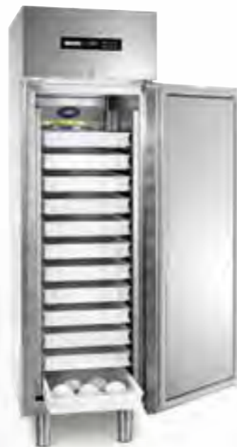
mod. S PIZZA

8 vaschette polietilene 8 polyethylene containers (400 x 600 x h 130)