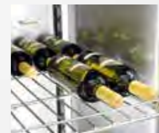
Griglia inox portabottiglie orizzontali S/S horizontal shelf for bottles