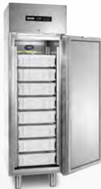
mod. S PESCE

3 griglie plastificate EN400x600 3 plastic coated shelves EN400x600